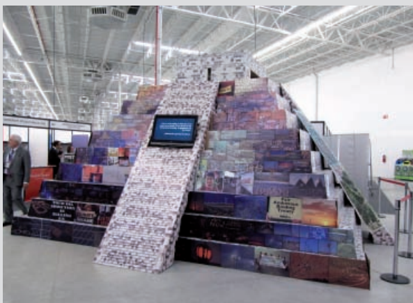
A Mayan pyramid built with recycled boxes and covered with images of hope for the talks at COP16.

The scope of what will be considered as relevant activities is broad and includes all of the points that were originally discussed in Bali during COP 13 in 2007. The agreement states that developing country parties can contribute to mitigation through the forest sector by reducing emissions from deforestation, reducing emissions from forest degradation, conserving forest carbon stocks, managing forests sustainably and generating value from forest carbon stocks. Parties wishing to engage in the above are encouraged to proceed with REDD+ readiness initiatives, namely by developing a national strategy or plan, establishing national or sub-national reference levels on either emissions or forest area and creating a forest monitoring system. The agreement also includes references to environmental and social safeguards for the protection of natural forests, biodiversity and ecosystem services and the rights of indigenous and forest-dependent peoples. The importance of addressing the drivers of deforestation is also mentioned and the Subsidiary Body for Scientific and Technological Advice (SBSTA) has been requested to develop a related programme of work.