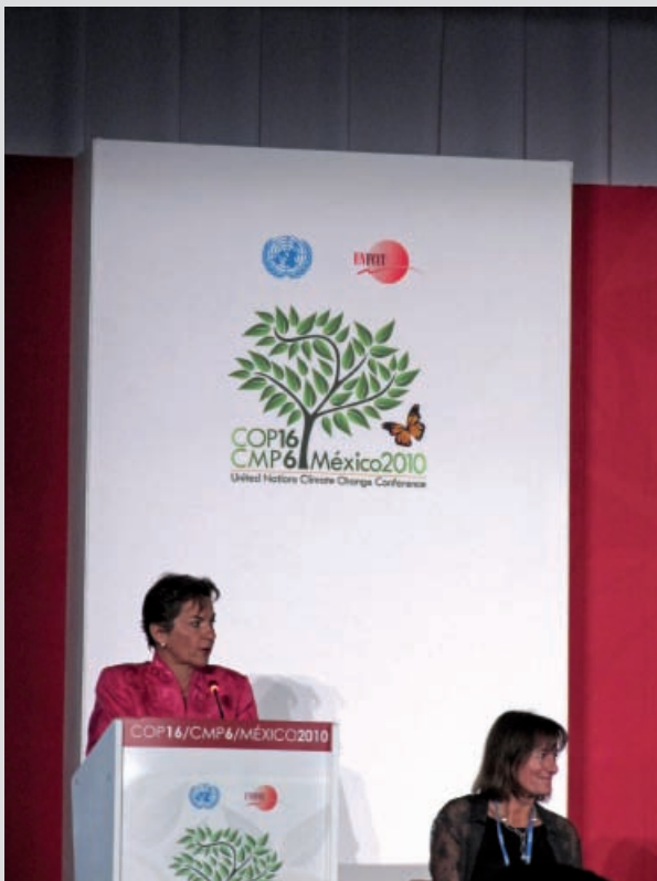
Christiana Figueres, the newly appointed Executive Secretary of the United Nations Climate Change Secretariat.

demands voiced for full recognition and implementation of forest peoples' rights, and the progress made in Cancún is not considered sufficient to ensure that rights will be protected during REDD+ action on the ground. Over and above the issue of forest-dependent people, questions remain as to how the money will actually be disbursed, and to whom. The REDD+ decision does not include any references to criteria that will ensure the equitable distribution of funds.