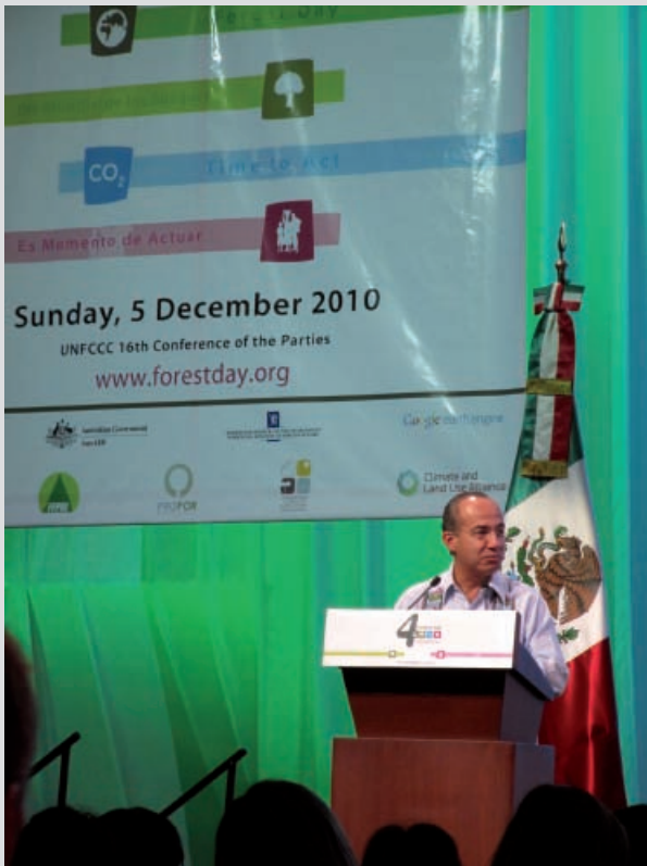
Mexico's President Felipe Calderón at Forest Day 4 in Cancún, discussing the urgency of reaching a deal on forests.