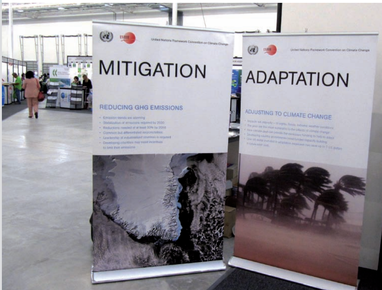
Mitigation and adaptation: two pillars of the negotiating agenda, along with technology and finance.

The agreements reached in Cancún will trigger intense negotiations under the various working programmes already launched. The first test of whether or not Cancún has really revived multilateral cooperation to address climate change will come soon enough, as negotiations resume in April to discuss the implementation of the decisions and further deliberate over unresolved issues. Putting flesh on the bones of the agreed frameworks without delay will be essential to sustain the momentum and good faith gained during COP 16. It is also crucial to promptly close the loopholes that threaten forests, as the Cancún Agreements are likely to fast-track multilateral action on the ground. Such action could damage both forests and the REDD+ initiative if critical details remain unresolved.