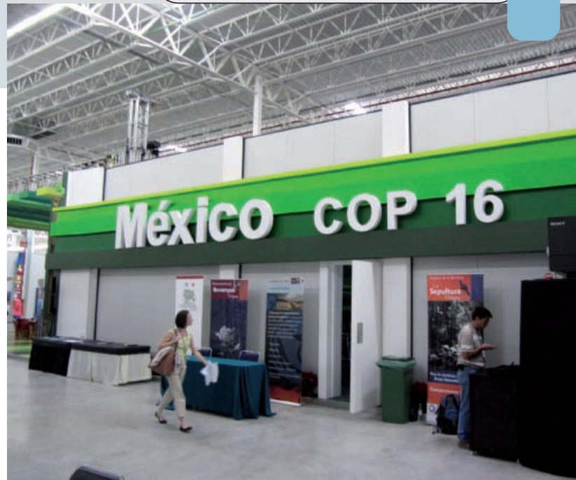
The 16 th Conference of the Parties (COP 16) to the United Nations Framework Convention on Climate Change (UNFCCC) in Cancún, Mexico.

The Cancún Agreements delivered two decisive texts, one on Long-Term Cooperative Action (LCA) and one on the future of the Kyoto Protocol, following the two negotiating tracks. The agreements materialized after much compromise by both developed and developing country parties and are considered as marking a “new era of international cooperation on climate change”, as Mexican President Felipe Calderón emphasized. Even though technical details and legal issues – notably on a global goal for reducing global emissions by 2050 and a second commitment period for the Kyoto Protocol – have been deferred to further negotiations, the Cancún Agreements contain key political decisions which will guide and catalyze comprehensive work programmes and substantive discussions in 2011. But do they really constitute a step forward or are they just a rushed deal stemming from the pressure to reach a successful outcome? We look into this question here, focusing primarily on the outcomes for tropical forests and adaptation.