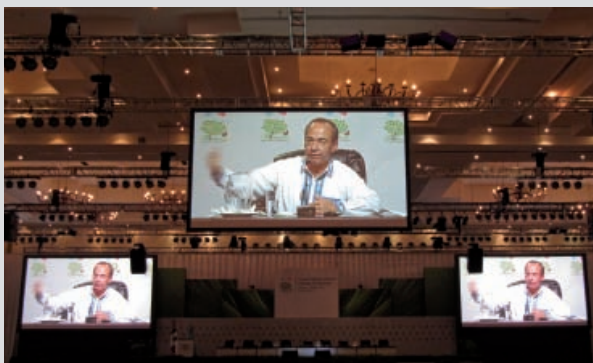
A speech by Mexico's President Felipe Calderón broadcasted in several meeting rooms.